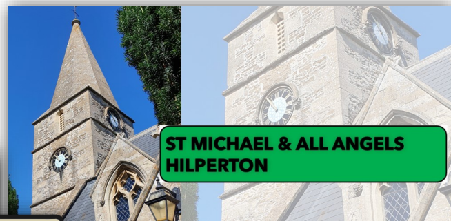
ST MICHAEL & ALL ANGELS HILPERTON