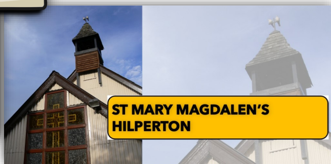
ST MARY MAGDALEN'S HILPERTON

Sharing God's Love; Serving our Community; Caring for Creation.