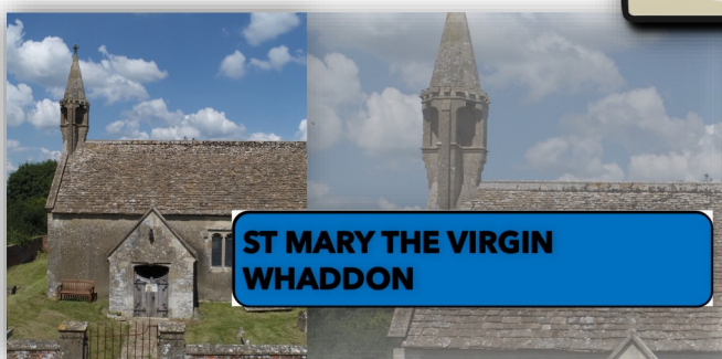
ST MARY THE VIRGIN WHADDON