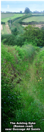
The Ackling Dyke (Roman road) near Gussage All Saints

There is also an Ancient Technological Centre which is an outdoor education centre and experimental archaeology site which benefits both schools and community ( www.ancienttechnologycentre.com )