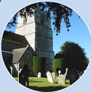
Cranborne (St Mary & St Bartholomew)

Cranborne (St Mary & St Bartholomew). It is Grade 1 listed and was an early monastic foundation which retains much of its earlier character including rediscovered medieval wall paintings. There is fine ring of eight bells. 21st century innovations include a new lighting system, kitchen units and lavatory. It is the largest church in the benefice as befits its place in the largest parish. A recently started Breakfast Church attracts mostly young families and takes place in the First School.