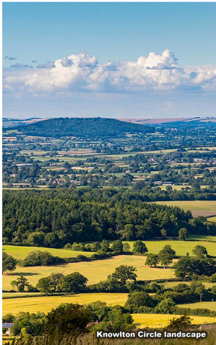
Knowlton Circle landscape