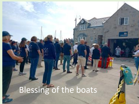
Blessing of the boats