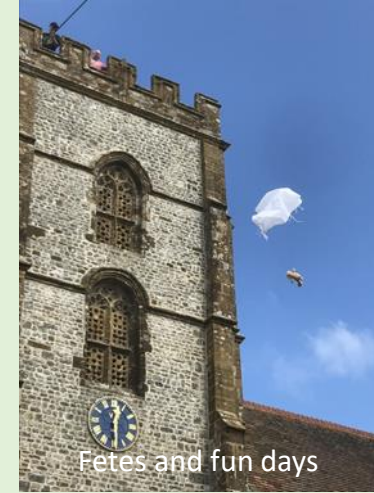
Fetes and fun days