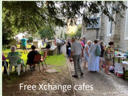
Free Xchange cafes

We would love you to hear about each church. We have a lot to say! There's more here . (Click on the church photo for more info)