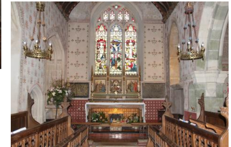
Altar with Christmas Nativity scene

The church which is Grade I listed is well maintained – recent work has included repairs to the plaster ceiling undertaken in mid-2023, enabled via generous grant funding from Dorset Historic Churches Trust, Erskine Muton Trust and Society of Friends of Silton (SOFOS).