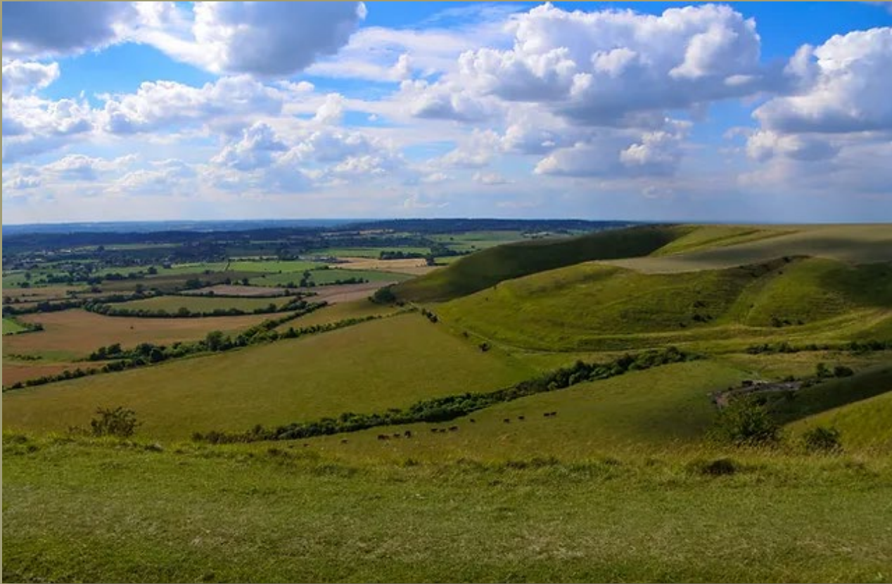
Parishes together in rural Wiltshire in the Devizes Deanery in the Diocese of Salisbury