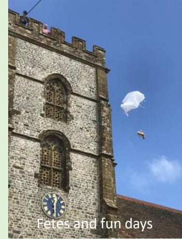
Fetes and fun days