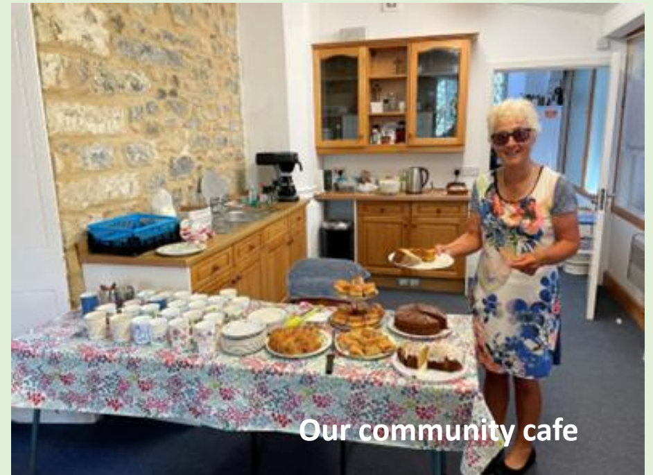
Our community cafe

We've got ideas and we hope you have too!