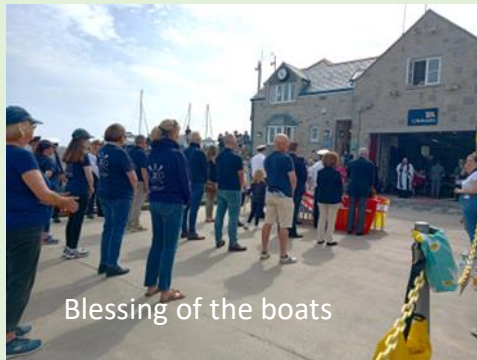
Blessing of the boats