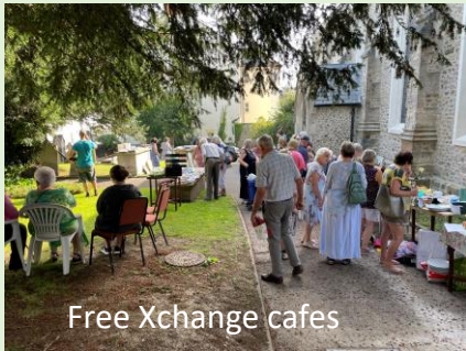
Free Xchange cafes

We would love you to hear about each church. We have a lot to say! There's more here . (Click on the church photo for more info)