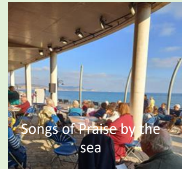
Songs of Praise by the sea