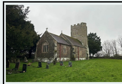
St Margaret's Church Margaret Marsh