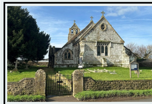
St Luke's Church West Orchard

The Orchards and Margaret Marsh Parochial Church Council