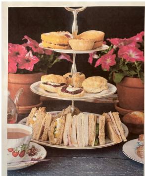
COMMUNITY CREAM TEA @ St Mary's Church - Sunday 19 th January - 3pm-5pm (£3.00 all inclusive). Come and meet old and new friends in a warm "home from home" environment.