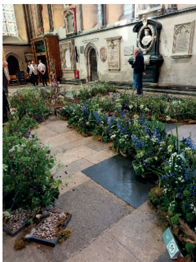
The 5 Rivers